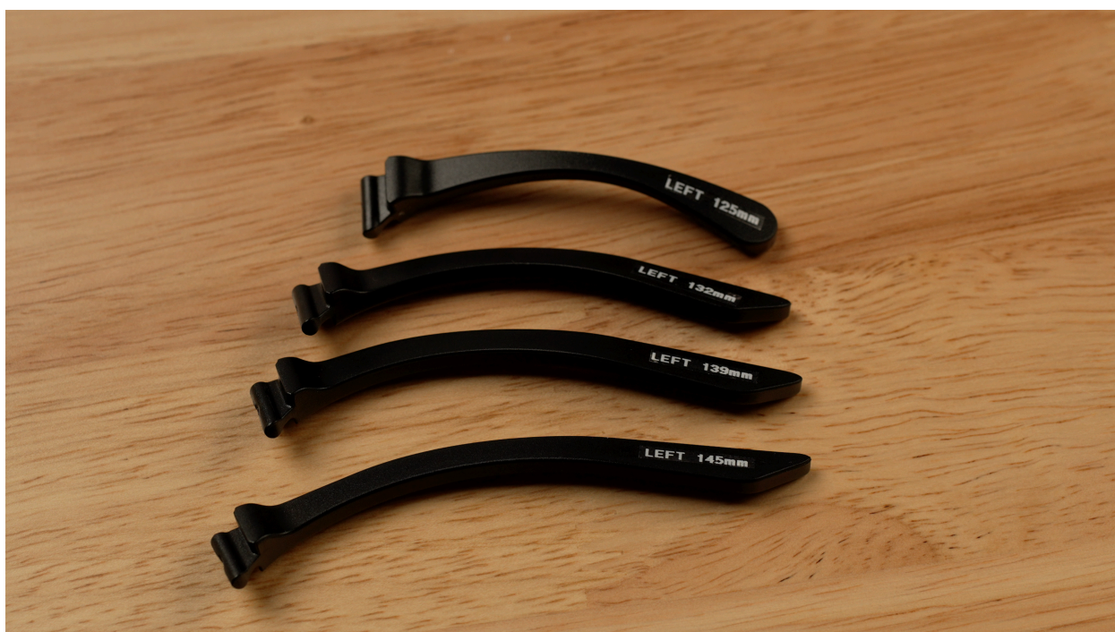
Four VEET temple tips of different lengths