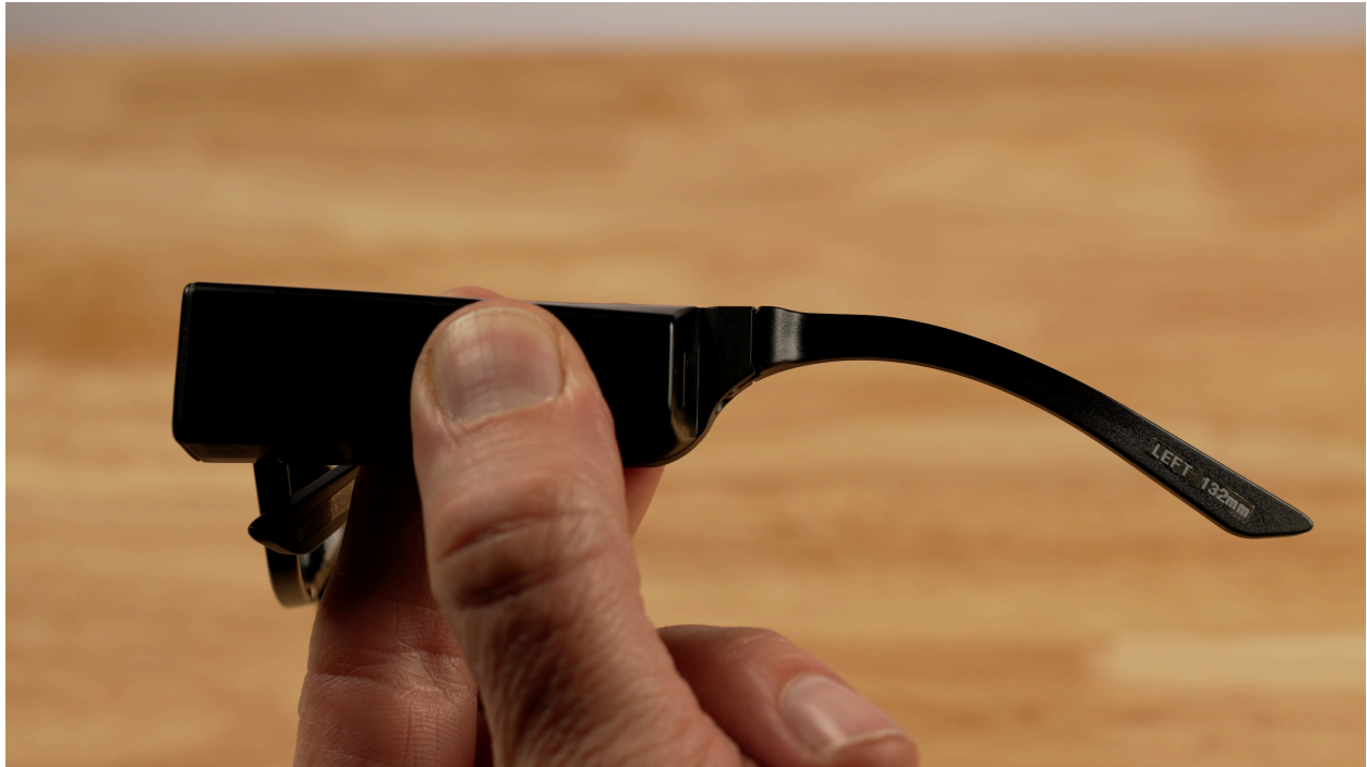
Adjustable VEET with temple tip attached