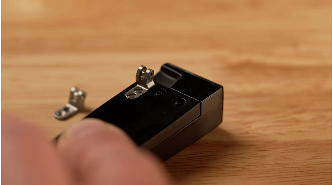
Two slot screws on VEET hinge