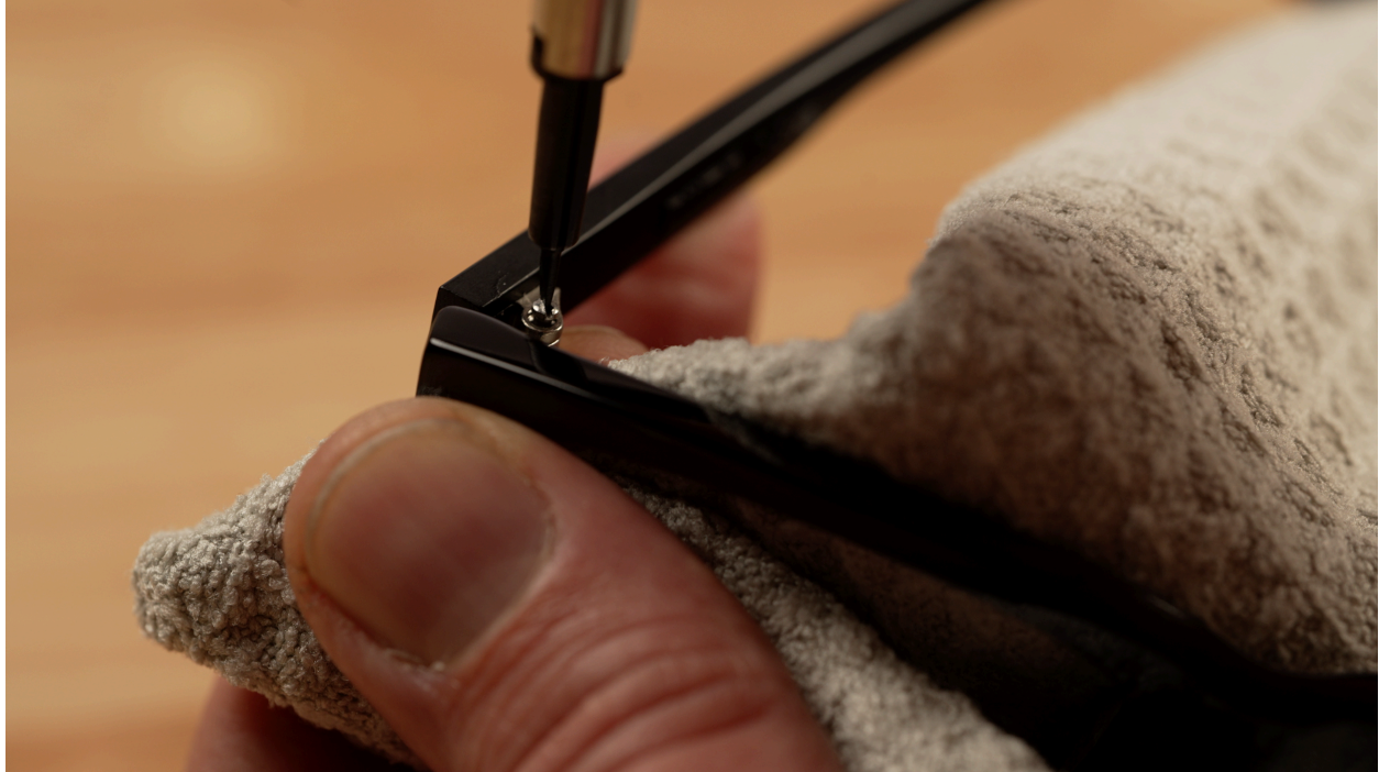
Attaching VEET temple arm to glasses frame