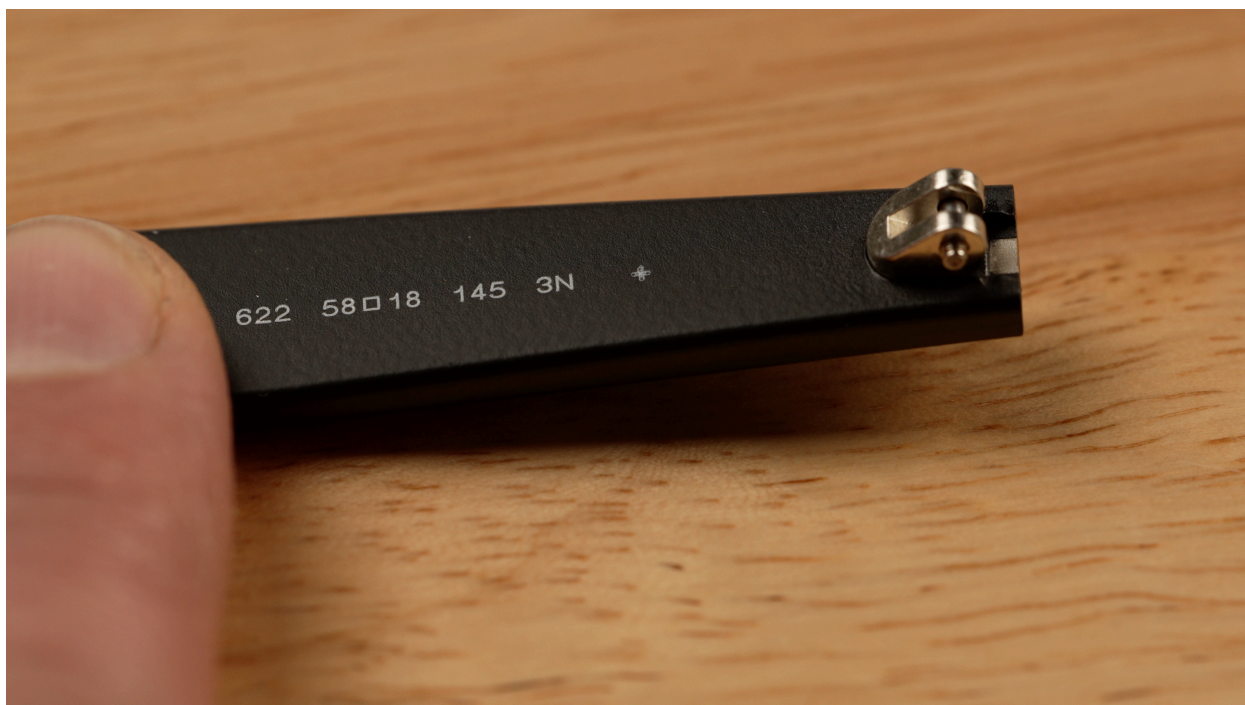
White markings on a commercial glasses frame's temple arm